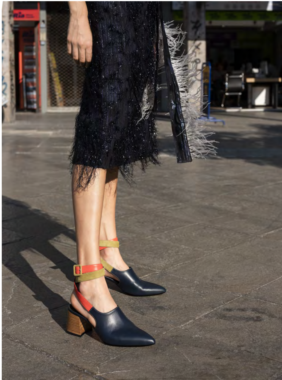
RITA SLINGBACK BLOCK-HEELED PUMPS BLUE