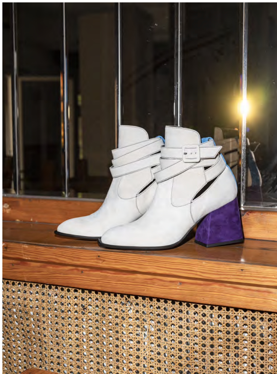
LORETTA ANKLE BOOTS WHITE