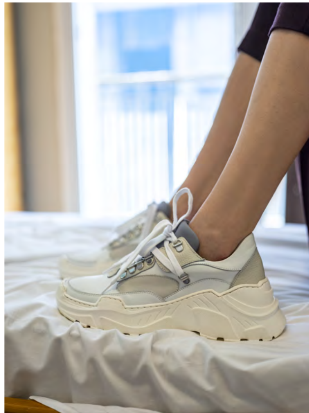
BONNIE WHITE - SNEAKERS