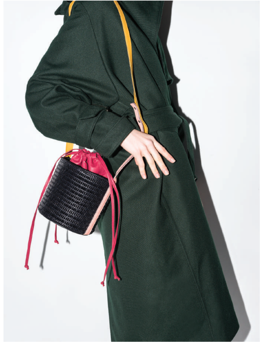
KAIA BUCKET BAG