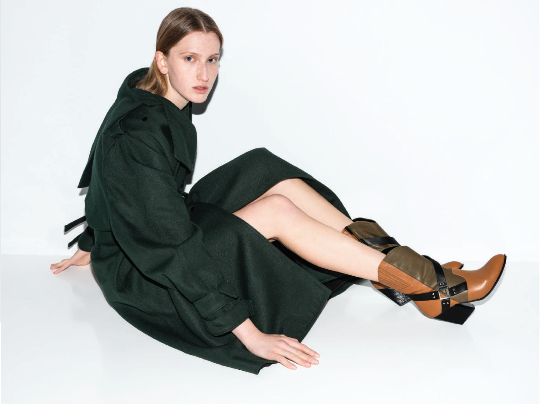
KATE WOMEN'S COWBOY BOOTS BROWN