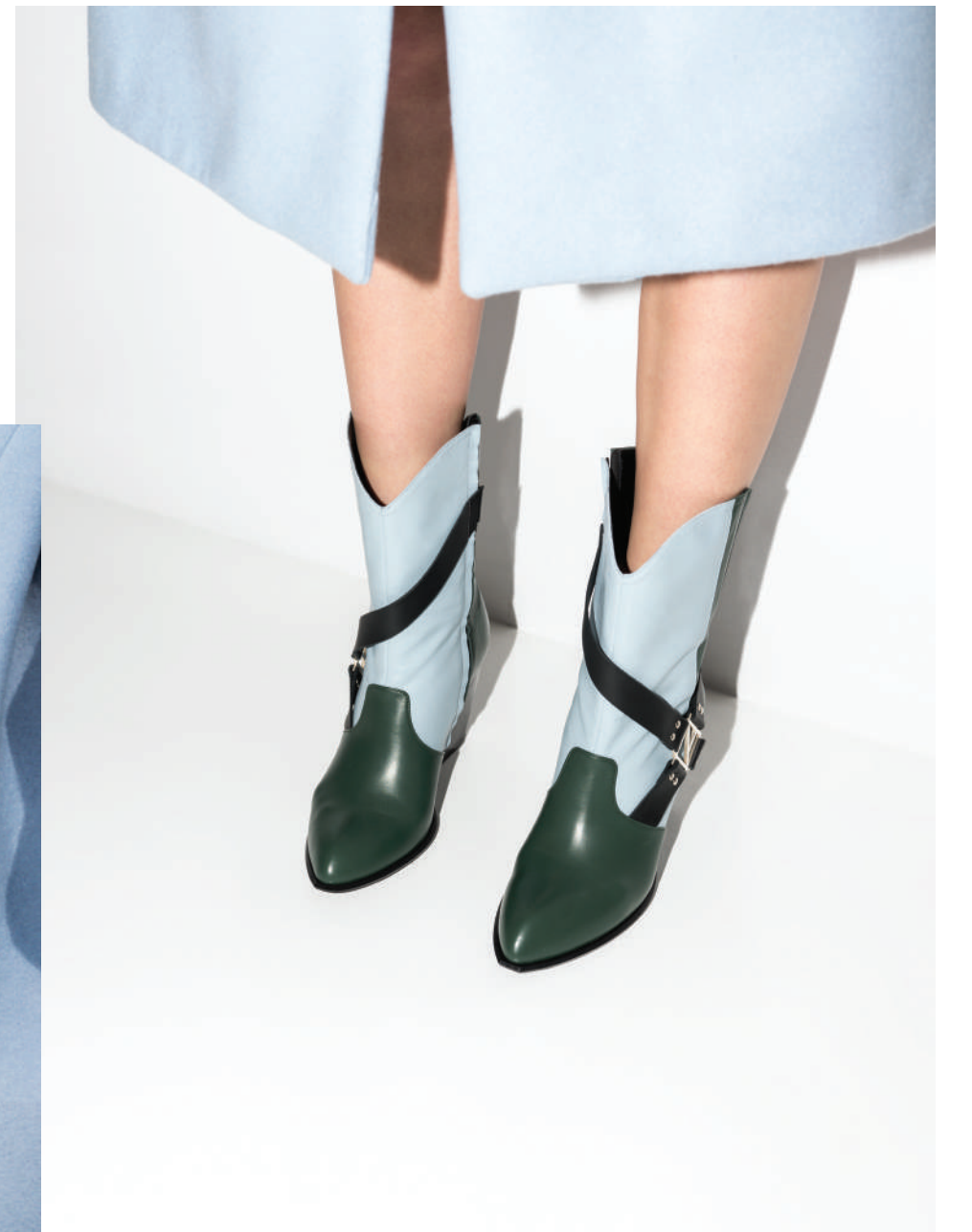
KATE WOMEN'S COWBOY BOOTS GREEN