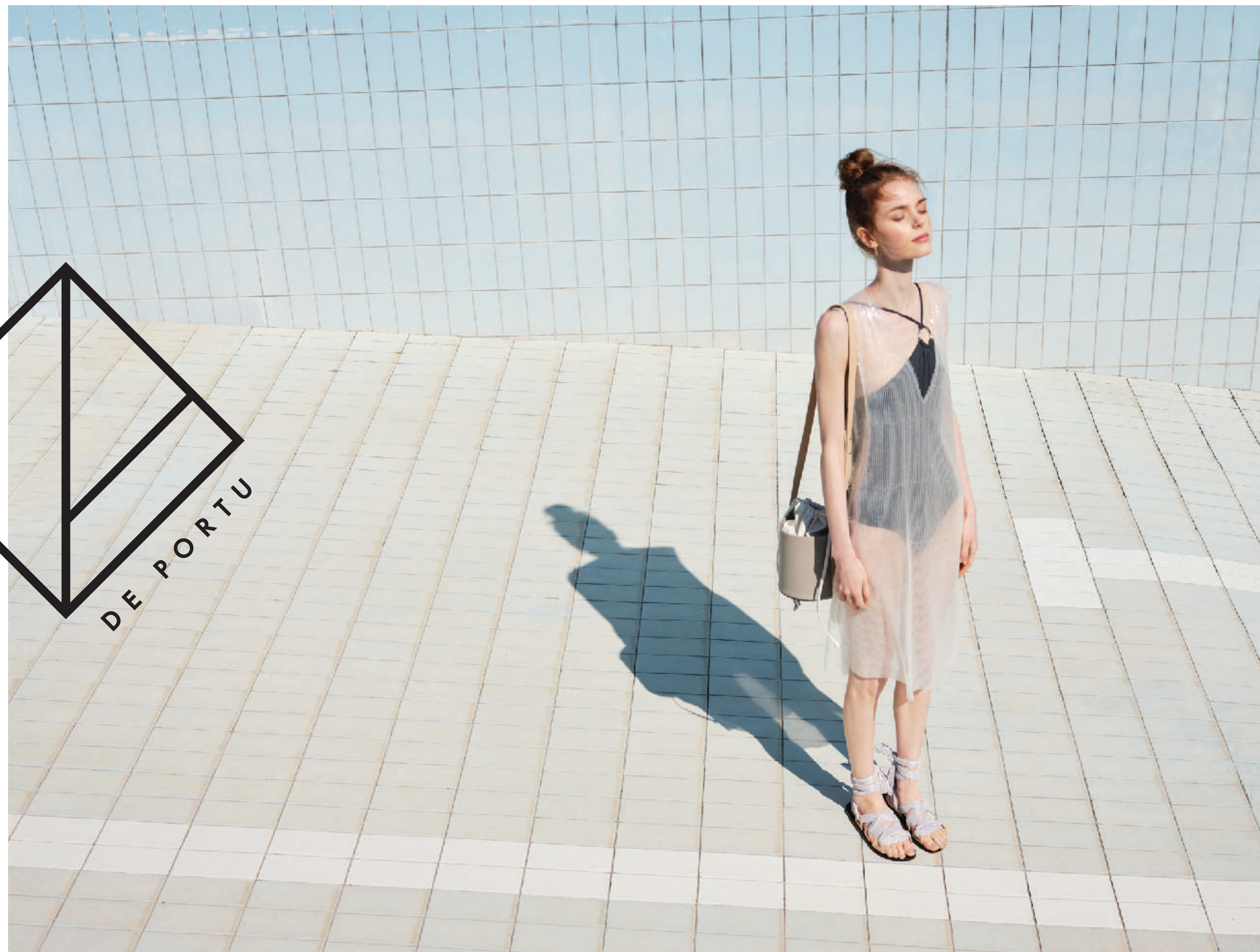
HANDCRAFTED SHOES & BAGS - LOOKBOOK SPRING/SUMMER '19